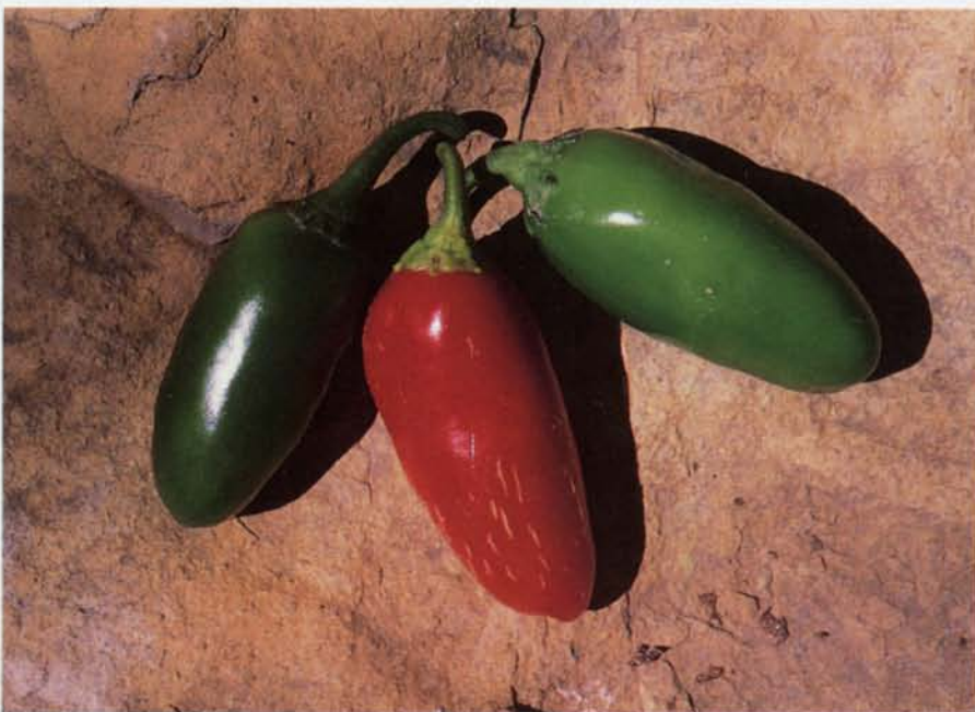
Fig. 2. Green and red stage of 'NuMex Primavera' jalapeño fruits.